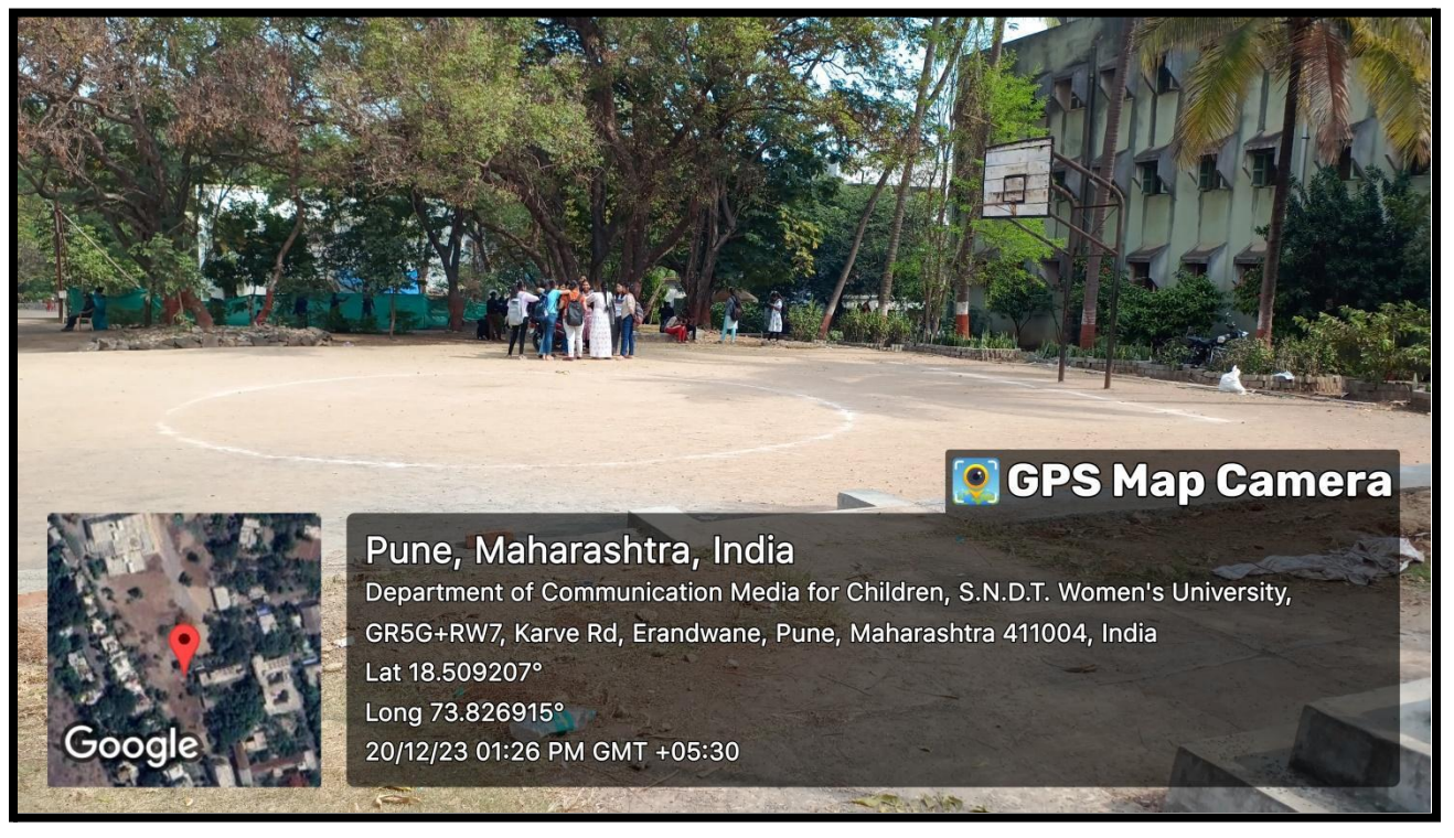
Sports Ground 2